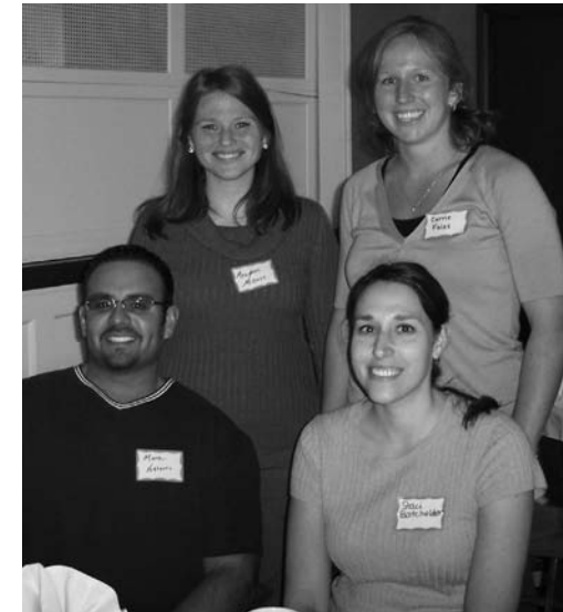
Michigan State University Medical Students